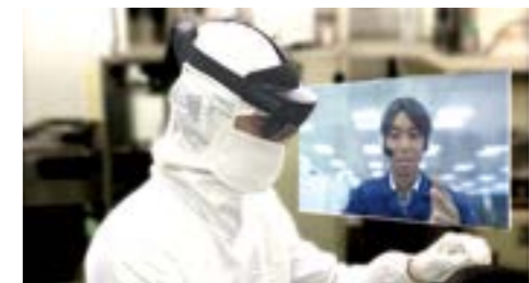
Using smart glasses (image)