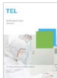
TEL Safety and Environmental Guidelines

If new safety warnings are identified after the product ships, we provide information to affected customers. We also strive to ensure that necessary information is communicated to any customers to whom we deliver products that involve the use of hazardous chemicals or high voltage electricity.